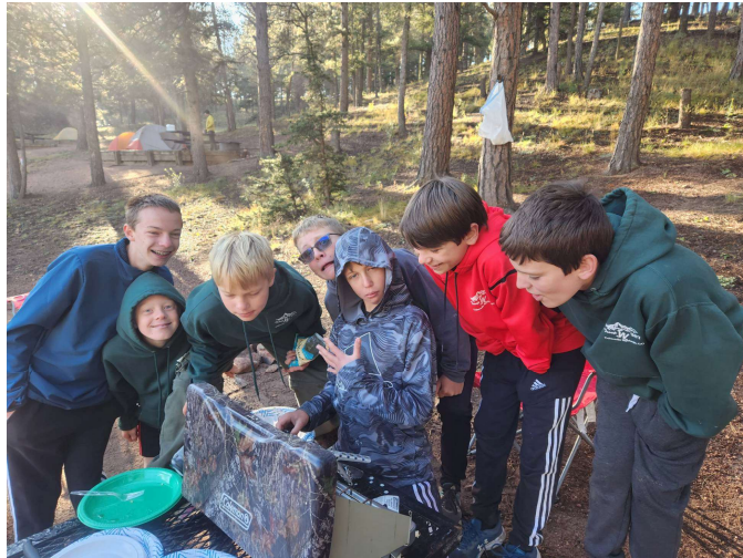
Eleven Mile Canyon Camping Trip

Wilson United Methodist Church Tuesday Evening, November 15, 2022