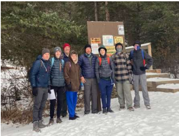
Raspberry Mountain Hiking Trip

Thank you to all parents/people that volunteer their time, money, and energy to better Troop 287 and make these programs possible